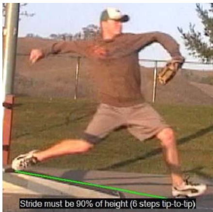
(A) Reps 1-5

Practice the 'Full Windup', focusing on building rhythm during first step and maintaining controlled movement to the plate