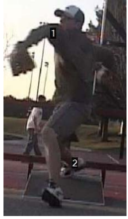
(B) Reps 6-10